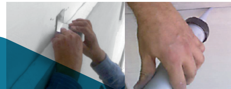
Seal edges, apply surface finishes