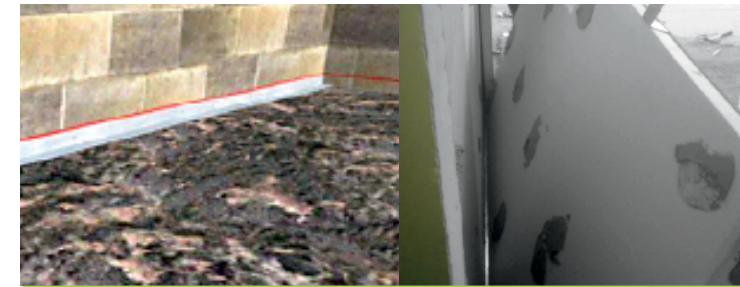
Fix Z-angle for panel modular assembly